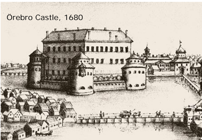
Örebro Castle, 1680