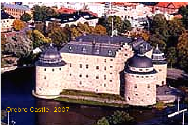
Örebro Castle, 2007