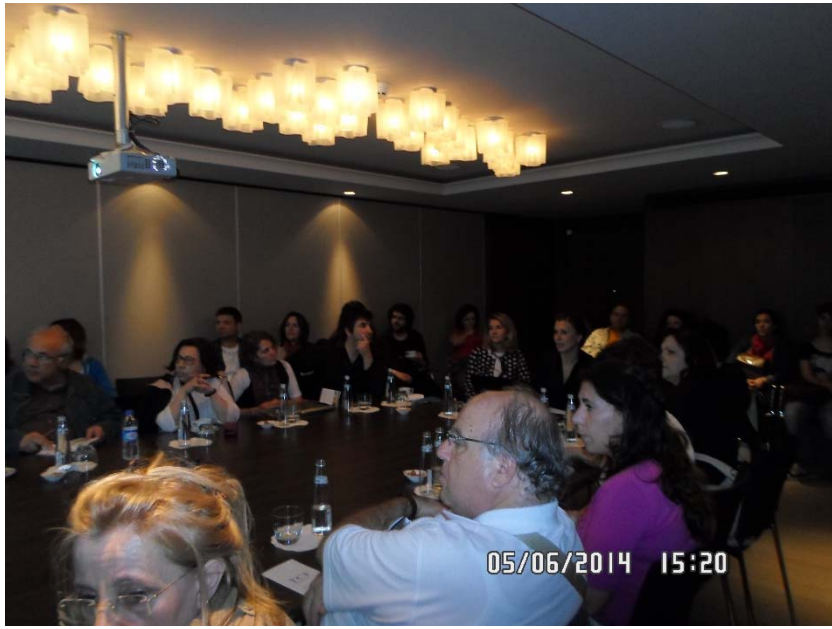
At the Turkish Cultural Foundation