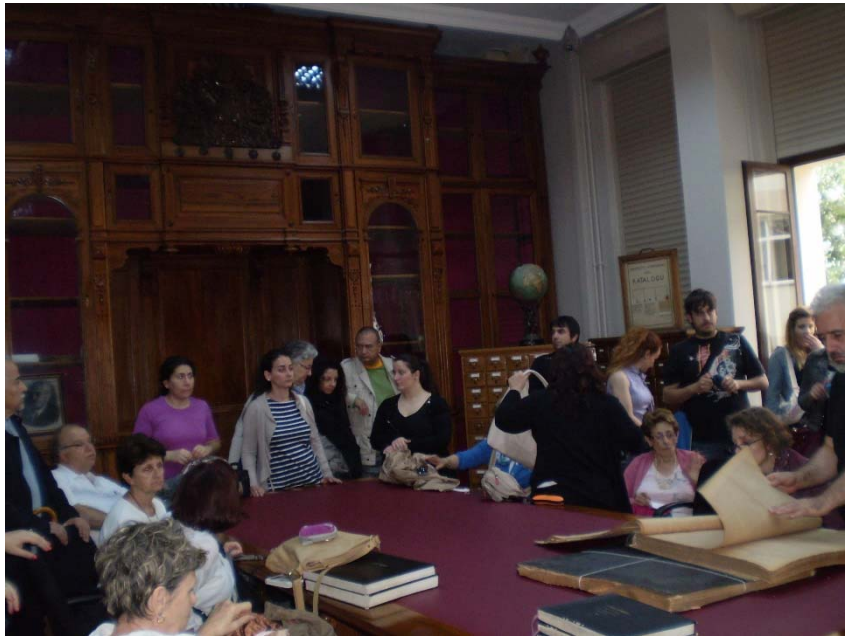
Library of Manuscripts and Rare Prints of Istanbul University