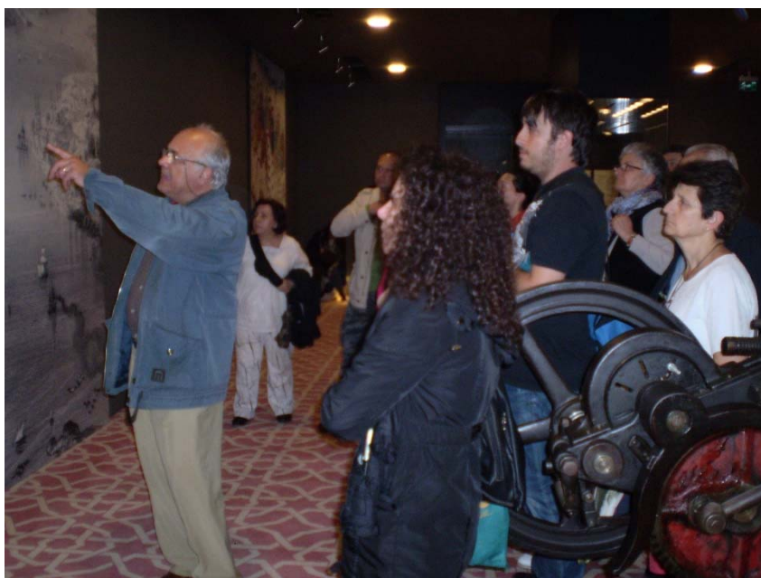
Ottoman Archive, Museum

Additionally, noteworthy Byzantine and Ottoman monuments, as well as museums, were also visited.